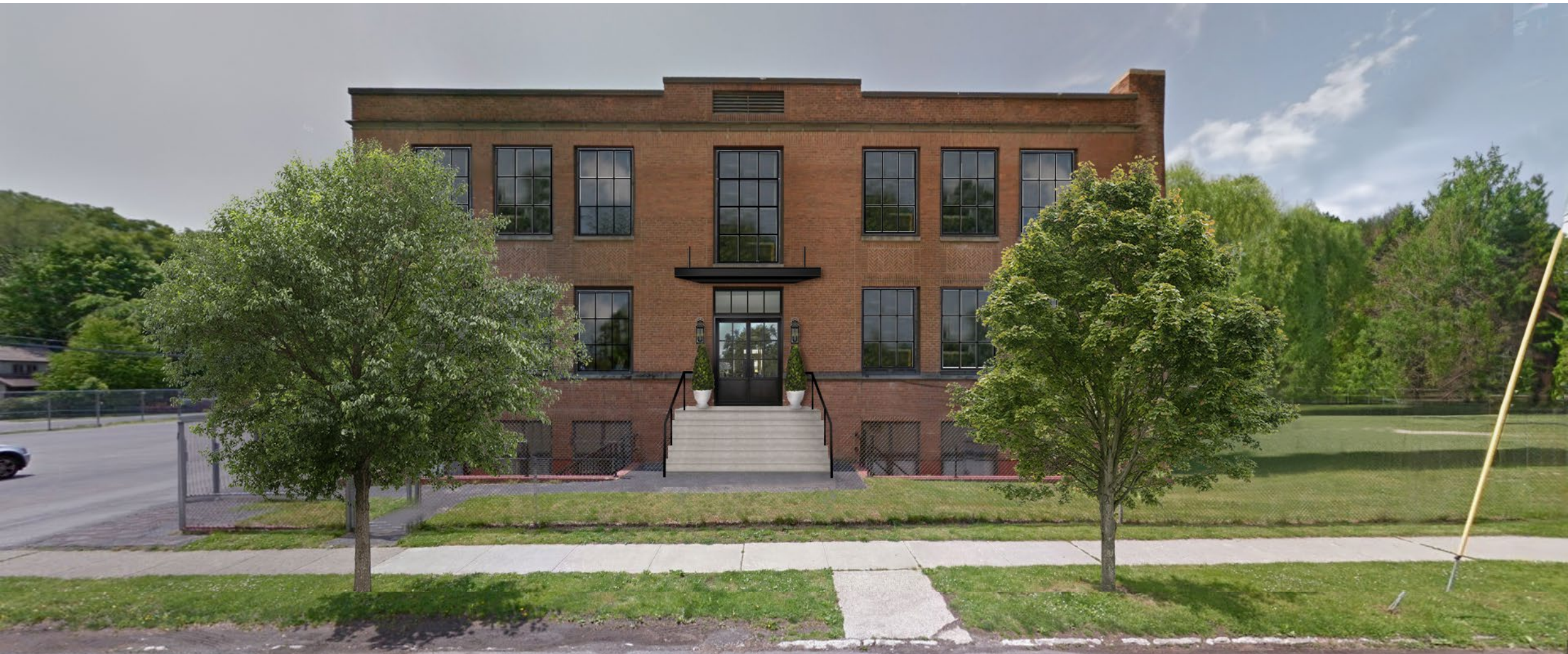
Study with new front door—Red brick