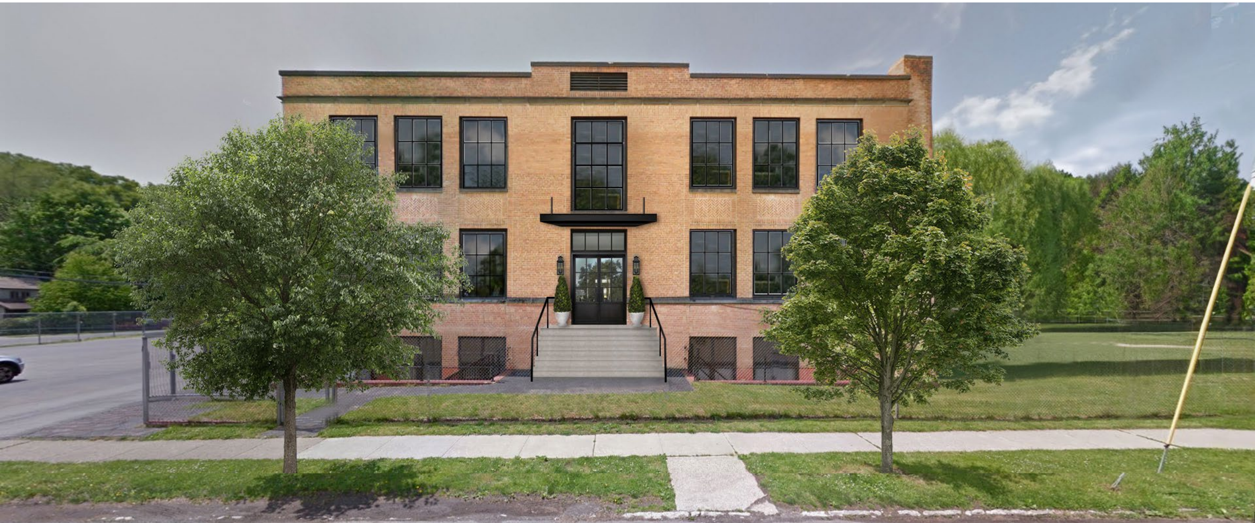
Study with new front door—Lime washed brick