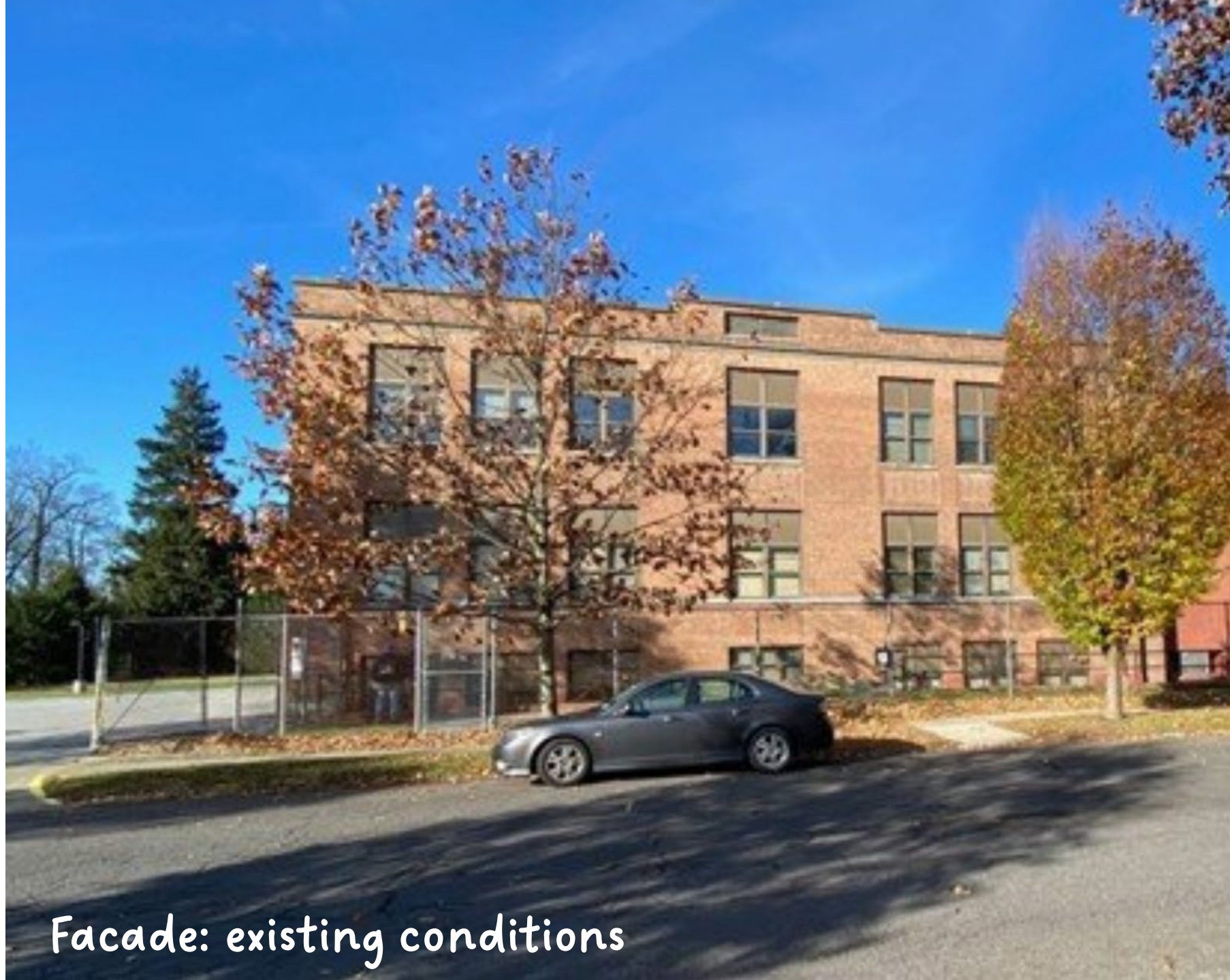
Facade: existing conditions