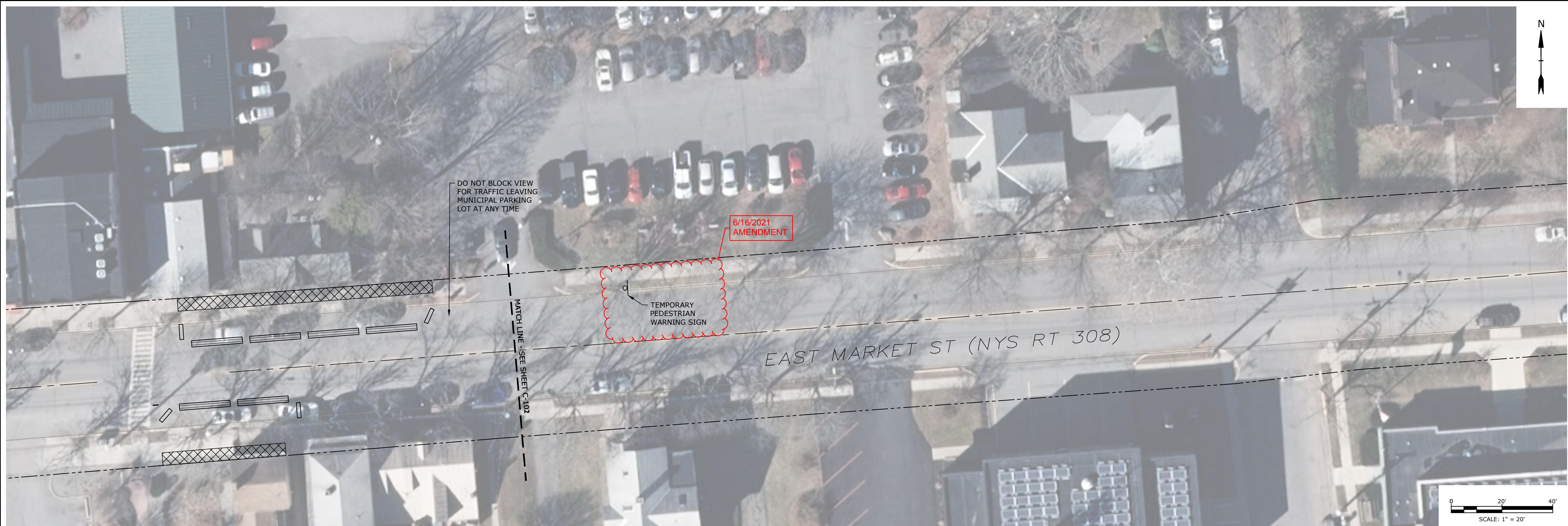
EAST MARKET STREET (NYS RT 308) PLANNED ON-STREET DINING SCALE: 1" = 20'