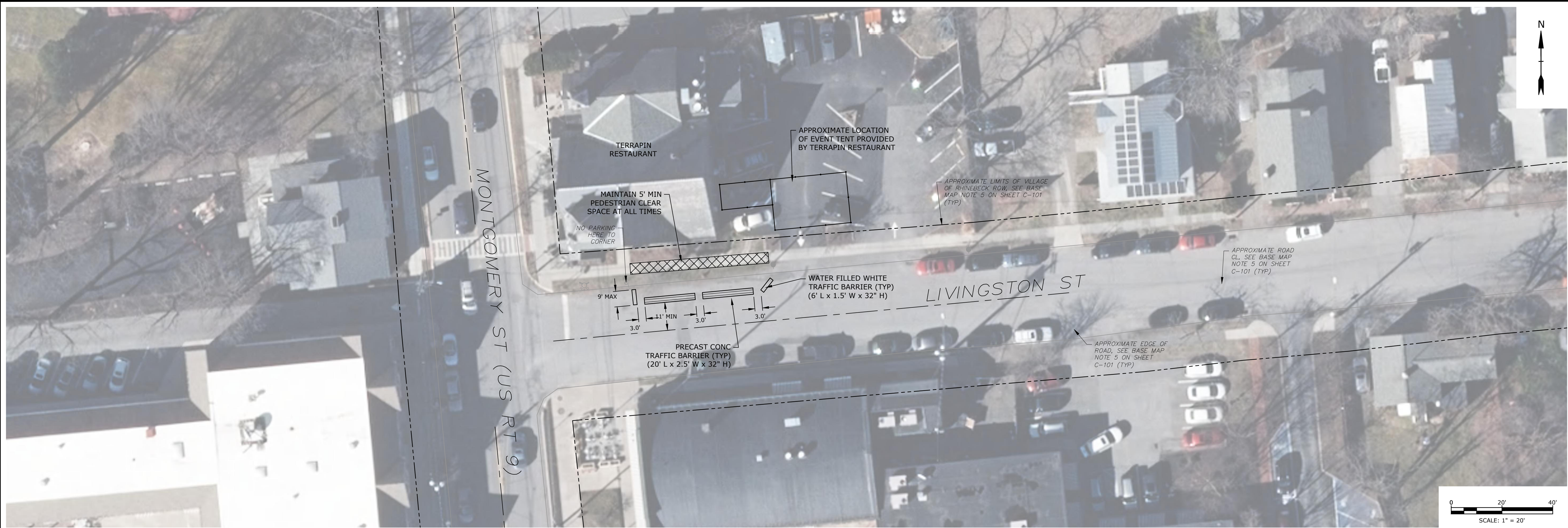
LIVINGSTON STREET PLANNED ON-STREET DINING SCALE: 1" = 20'